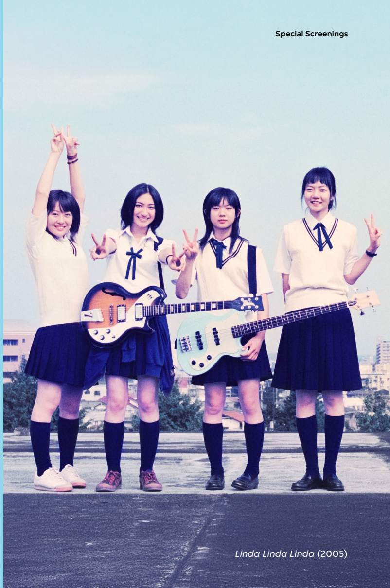
Linda Linda Linda (2005)