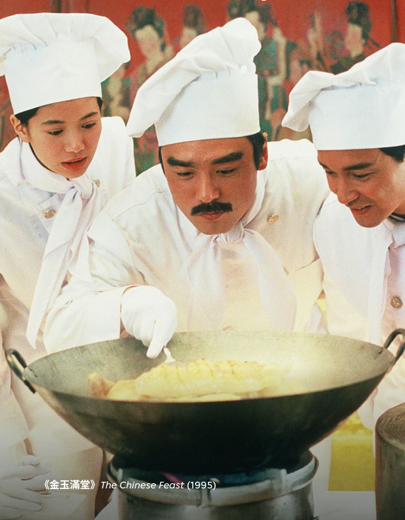
《金玉滿堂》 The Chinese Feast (1995)

1995 年的四部賀歲片中，周星馳主演的兩集《西遊記》當時反應平淡，徐克執導的《金玉滿堂》則叫好叫座。