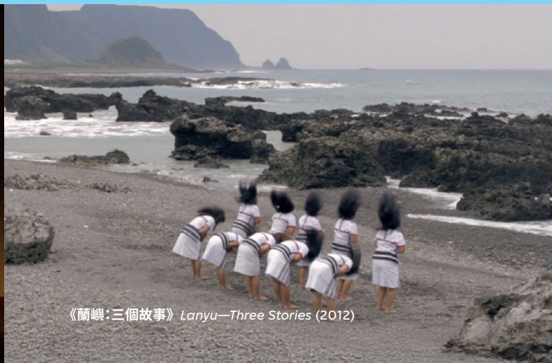
《蘭嶼：三個故事》Lanyu—Three Stories (2012)