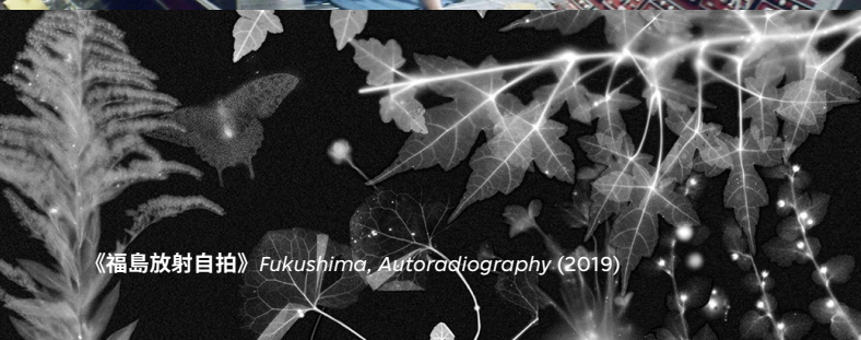
《福島放射自拍》Fukushima, Autoradiography (2019)