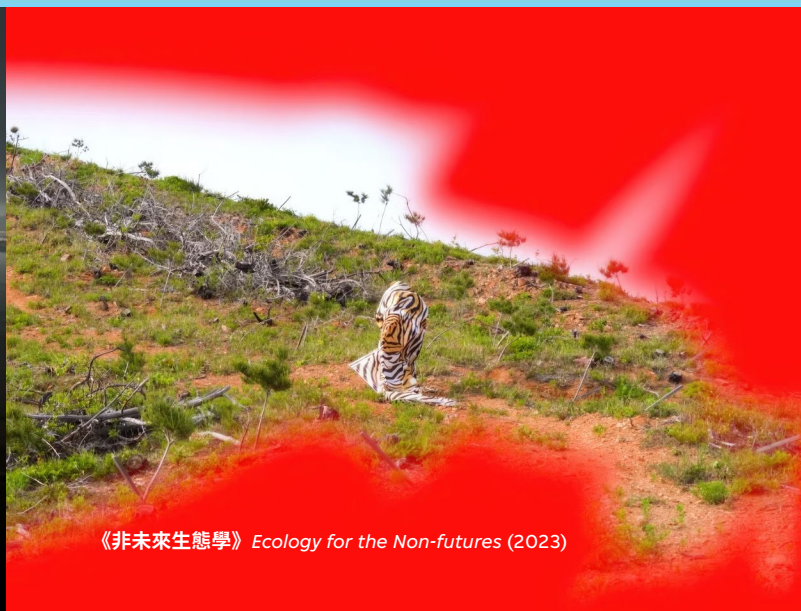
《非未來生態學》 Ecology for the Non-futures (2023)