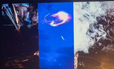
《韌性共鳴》Resilient Echoes (2026)