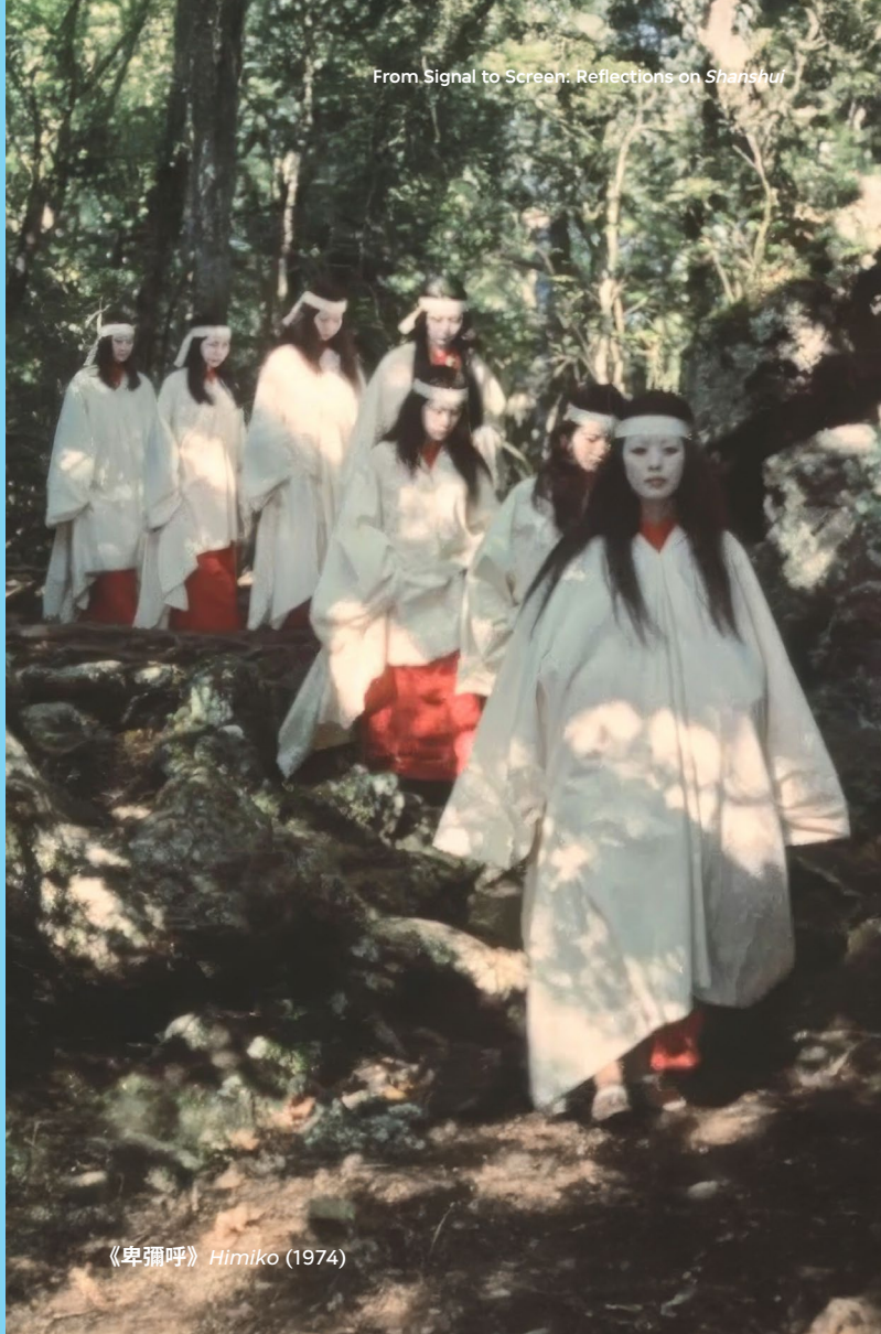
《卑彌呼》 Himiko (1974)

The programmes underline the intricate relationship between stillness and motion, vision and imagination, the immediacy of experience and the persistence of historical memory—thereby generating new ideas and creating connections between individual programmes and the exhibition. As human beings continue to evolve within their traditional social and knowledge frameworks, they become an ever more integral part of the ecosystem. From Signal to Screen draws on the distinctive voices of leading artists and filmmakers to call for our increased awareness of these frameworks.